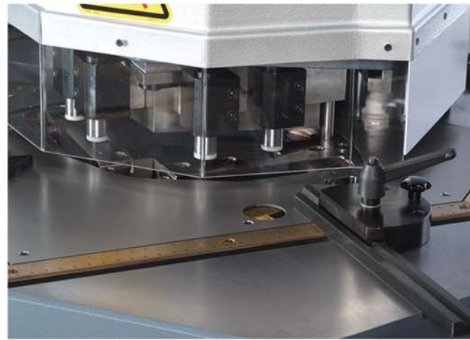
T-Slotted Table with Disappearing Stops Material Hold Downs